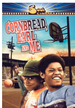
Cornbread Earl & Me