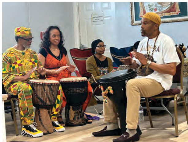
The Drum Circle

A heartfelt thank you to all our sponsors, donors, vendors, supporters and volunteers, we could not do this without you. I wish everyone a blessed and prosperous New Year!