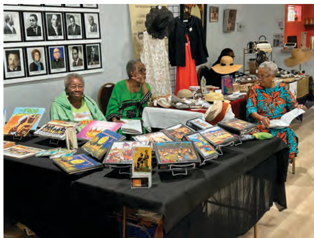
A few Kwanzaa Celebration vendors