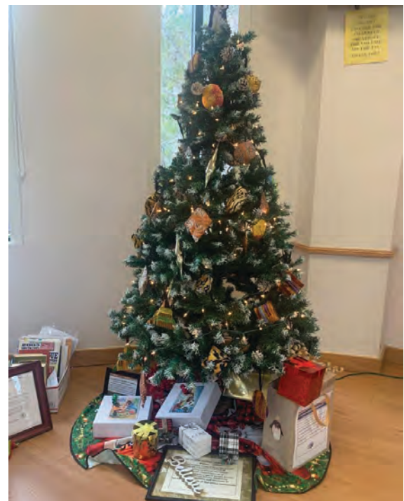
AACS 2024 Christmas Tree Flagler County Library, Palm Coast, Fla.

In closing, I would like to mention that at the recent AACS Awards Ceremony, EACH awardee was still active in various capacities. We keep giving!